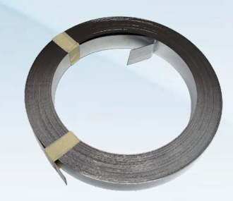
LP-2375 Galvanized strap is fed through the bolt and twisted around to tension down the strap.