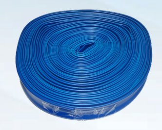
LP-2382 Sheathing covers galvanized strap to protect the tank.