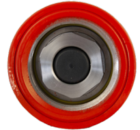
Neoprene Seal (Black) High Flow Design