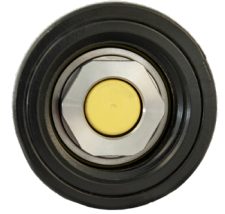
FKM Seal (Yellow) High flow design