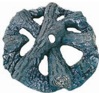
Ceramic Log Kit Included