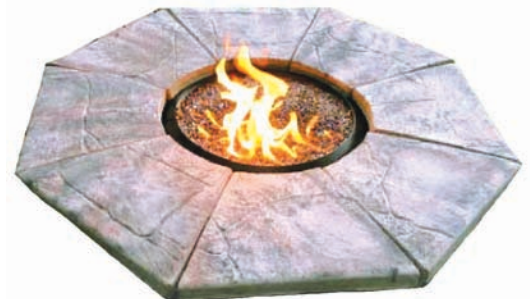
Optional Stone Surround Kit

The Fire Dancer® is light weight and compact. It will operate for 20 hours on a 20 lb. bottle of propane. The hose, regulator and valve are all UL approved components. 10 ft. hose assembly wraps around unit for easy storage and transport.