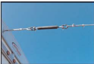
In-line gas springs.