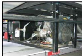
Optional: 28 hp Honda power pack.