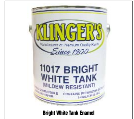
Bright White Tank Enamel