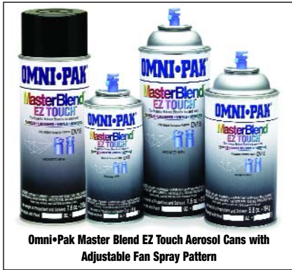
Omni-Pak Master Blend EZ Touch Aerosol Cans with Adjustable Fan Spray Pattern

High performance tank coatings have a 5 year performance level with gloss retention. Bright white and light gray paint contain a mildew resistant additive. All tank coatings are available in a variety of colors in 12 oz. aerosol cans, 1 gallon cans or 5 gallon pails. Asphaltum, urethane tar and penetrol are also available.